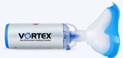
VORTEX with Adult Mask 4 years and up Part No.: 051F8300 HCPCS No.: A4627