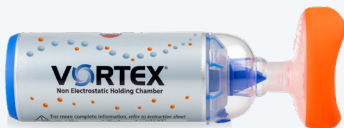
VORTEX with Pediatric Mask, Sm 0 - 1.5 years Part No.: 051F8100 HCPCS No.: A4627