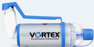
One-Handed Operation Aid Part No.: 044F5100