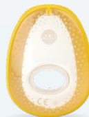
VORTEX Pediatric Mask, Med 1 - 4 years Part No.: 044F8200 HCPCS No.: A7015