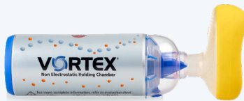
VORTEX with Pediatric Mask, Med 1 - 4 years Part No.: 051F8200 HCPCS No.: A4627